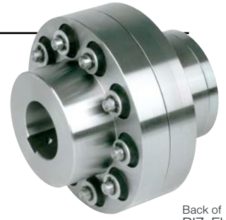
Back of RIZ..ELG2