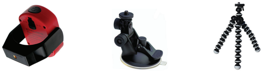
BACK VIEW MXN10170 MXN10171