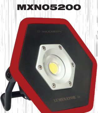
With magnet order MXN05201