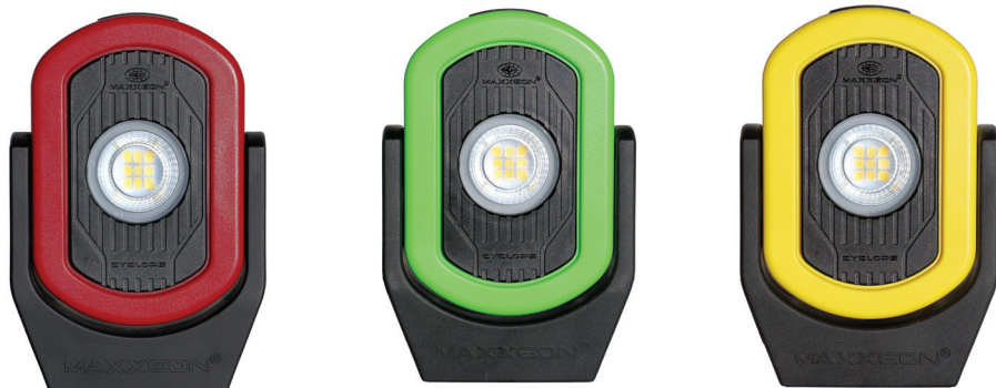
MXN00810 MXN00811 MXN00812