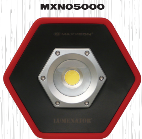
With magnet order MXN05001