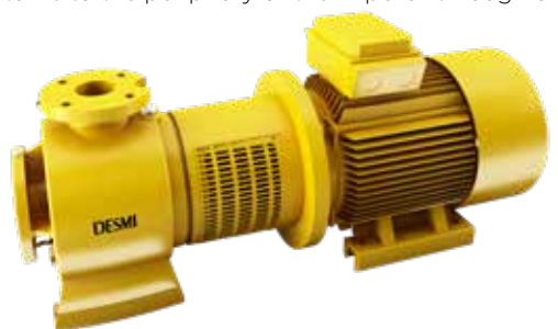
MODULAR S - a theme in MODULAR construction

The air escapes through the pressure pipe and the air-separated liquid returns to the periphery of the impellar through channal F.