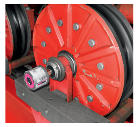
The guide rollers of a mountain railway are supplied with the necessary lubricant.