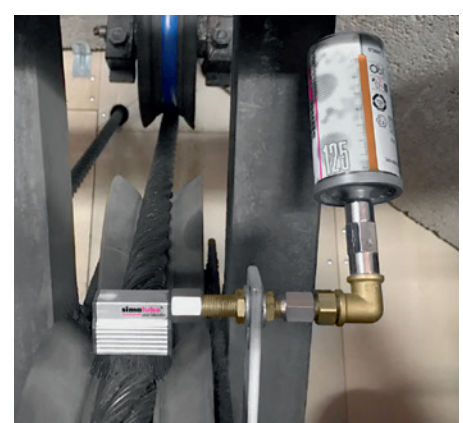
The cable of a cablecar is lubricated by a simalube lubricator. The lubricant is applied with a brush which also cleans the cable.