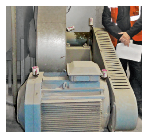
A combustion fan lubricated with two 60 ml and two 125 ml simalube lubricators.