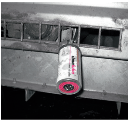
simalube lubricates bearings on a conveyor belt.