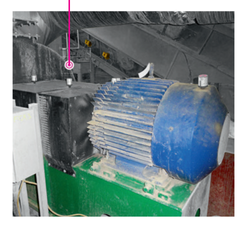
The FGR ventilator is lubricated by simalube