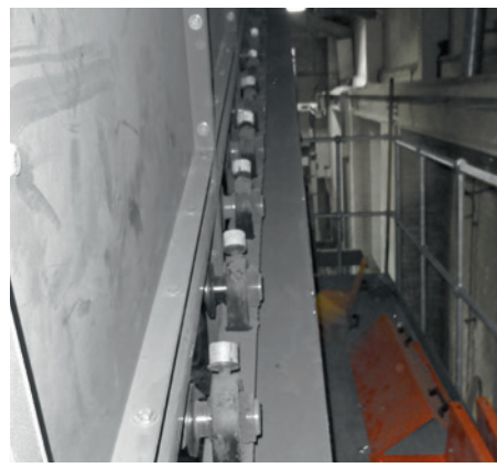
Dozens of 30 ml simulube lubricators provide the bearings of a conveyor belt with the necessary lubricant.