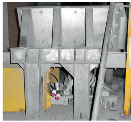
A vibrating conveyor lubricated by several 125 ml simalube lubricators.