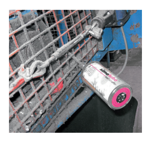
The externally installed simulube prevents dirt from entering the lubrication point.

«simalube increases employee safety in factories»