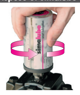
Either refill or dispose of empty lubricators