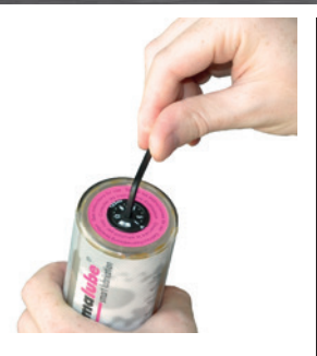
Activate dispensing time with 3 mm Allen key