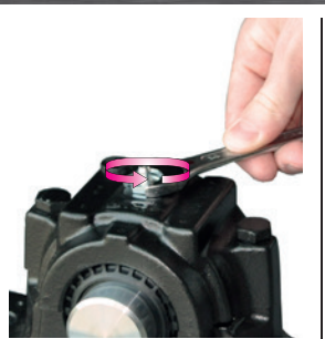
Remove connector nipple