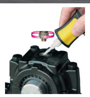
Screw in reducing nipple (if necessary, seal lubrication point)