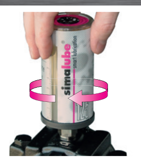
Screw in lubricator