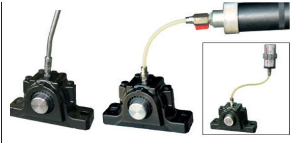
Lubricate the grease lines with a grease gun (fill tubes completely)