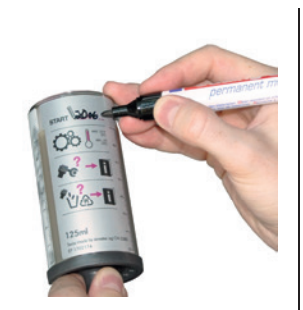
Write in activation date