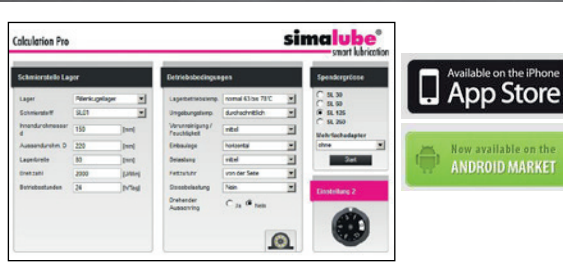
Use "Calculation Pro" to choose correct lubricant, dispensing time, and lubricator size.

("Calculation Pro" is available at www.simatec.com, in the App Store, and in the Android Market.)