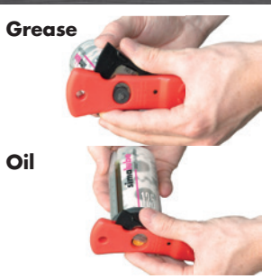
Cut off plug