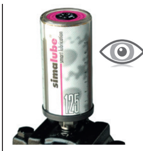
Regularly check simalube